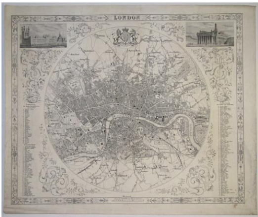
211. London. £420

Fox Maule-Ramsay (1801–74), 11th Earl of Dalhousie, was Lord Panmure between 1852 and 1860. Stock no: 7102