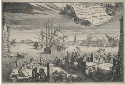
210. Les Costes de France Sur l'Ocean et sur la Mediterranée Corrigées, Augmentées, et Divisées . en Capitaineries Garde-Costes, Dediées A Monseigneur le Dauphin Par Son tres Himble et tres Obeissant Serviteur et Geographe De Fer. £280

A Paris Chez le O.r de Fer dans l'Isle du Palais Sur le Quay de l'Orloge a la Sphere Royale. avec Pri. du Roy 1690. Engraved titlepage. 225 x 335mm. Splits in upper and lower centrefold. Titlepage from Nicolas de Fer's atlas of charts of the French coasts.